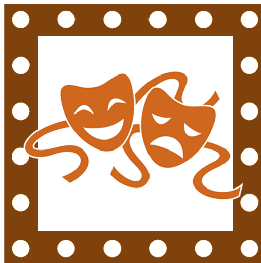
Design #2 (Brown and Orange Ink)

*Stop by the bulletin board in J-Hall to see the color design!*